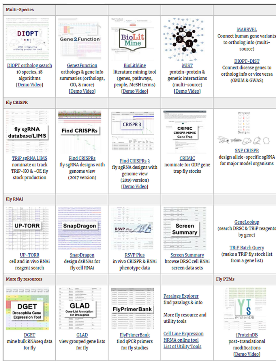
Figure 1. New look of the DRSC/TriP online tools landing page.

In 2013, we made available our first-generation CRISPR single guide RNA (sgRNA) design resource for Drosophila , Find CRISPRs (18), a searchable database of pre-computed sgRNA designs that includes a genome browser-based user interface. In 2015, we replaced the original tool with an improved version incorporating efficiency prediction scores based on in-house Drosophila data (18,19) with the same style of genome browser-based user interface (currently referred to as the ‘2017’ version, reflecting the last update). A limitation of these first two versions of the resource is that users can only query one gene at a time and have to click through all sgRNA designs to find an optimal design. More recently, we launched Find CRISPRs 3, the third version of the resource (currently referred to as the ‘2019’ version, re-